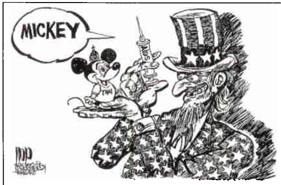
1991: The "guinea pig" phase (Bangkok Post) leads to . . .

Another important point concerns the international debate on HIV vaccine trials. Ethical guidelines like the Helsinki Declaration only consider an individual's rights or choice. We also must consider ethics in terms of communities and countries that benefit from vaccine trials. ♦